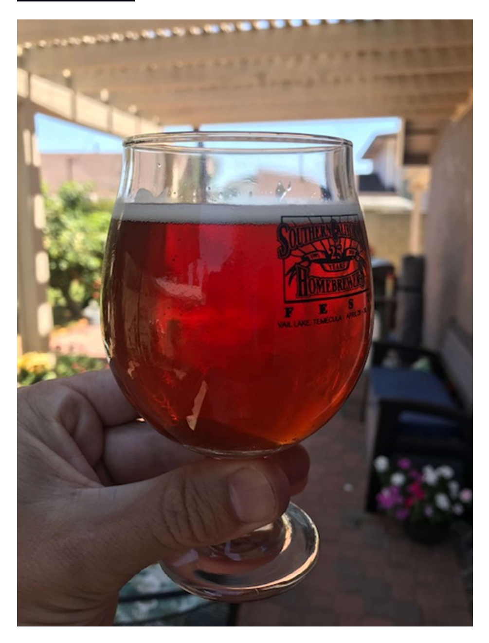
Recipe for 11 gallons final Kettle Volume, 10 gallons net into kegs.

Grain Bill (Infusion Mash at 154-156 F for 60 min; traditional sparge; <u>87% efficiency</u>: If lower efficiency on your system, bump up grain bill a little bit, proportionally):