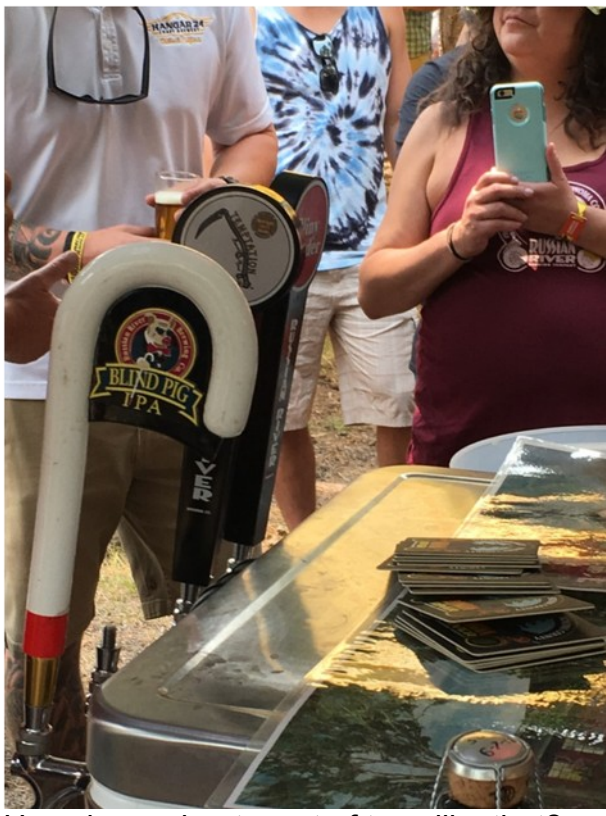
How do you beat a set of taps like that?

Finally, I just spent the previous weekend at one of my favorite beer festivals, the Mammoth Festival Beers and Bluesapalooza. If you haven't ever attended it's a multi-day mixture of great beer and amazing music amongst the pines in Mammoth Lakes, California. A terrific festival with multiple great breweries and some amazing live music.