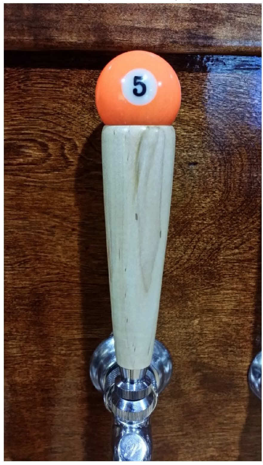
So that's it. Now you know how to make your own custom tap handles!

I'm happy with the idea for now. Now, I just need to make 13 more to complete the kegerator. Here is the finished tap handle on one of my taps.